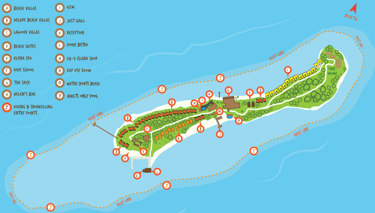
AERIAL OF HELENGELI ISLAND