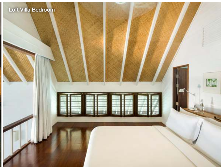
Loft Villa Bedroom