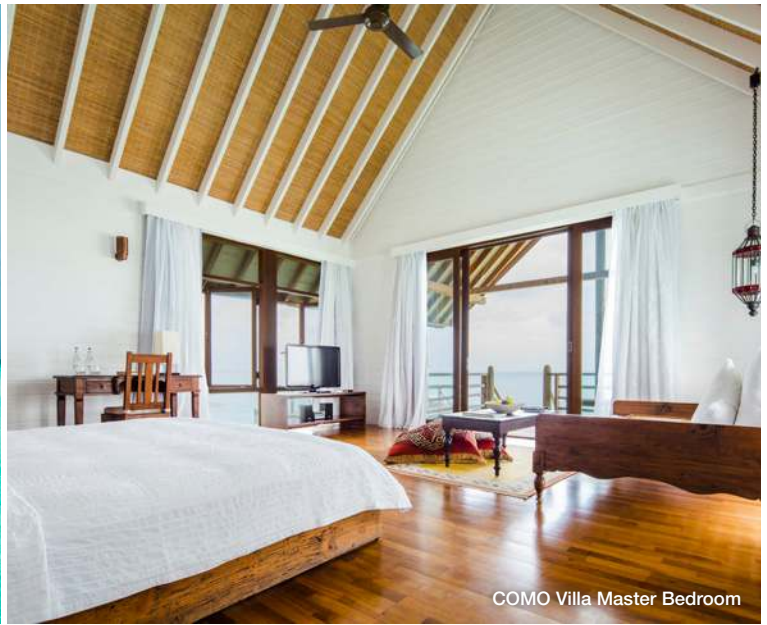
COMO Villa Master Bedroom