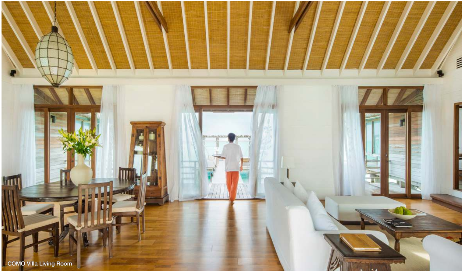
COMO Villa Living Room