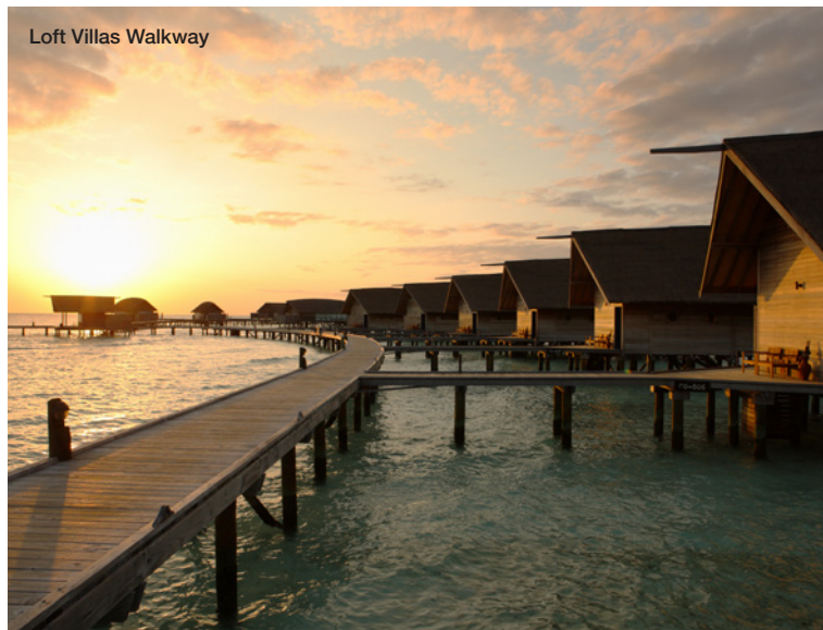
Loft Villas Walkway