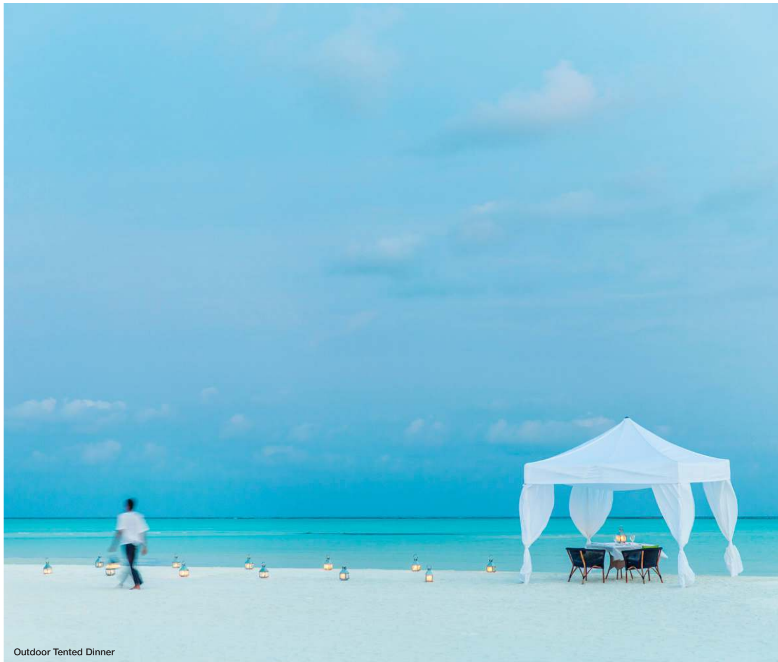
Outdoor Tented Dinner