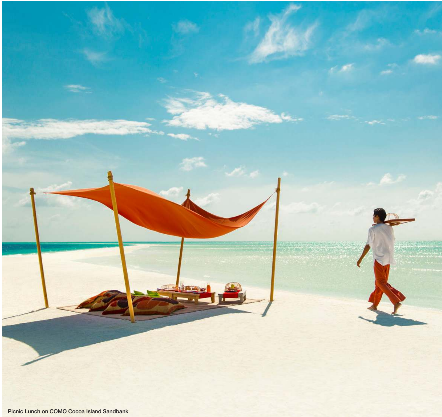
Picnic Lunch on COMO Cocoa Island Sandbank